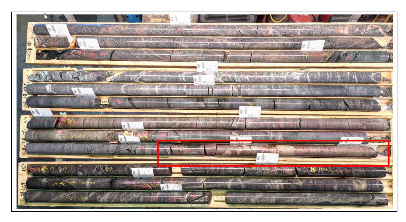
Figure 3. Massive and semi-massive sulphide mineralization from drill hole SR-21-07 (outlined in red box).